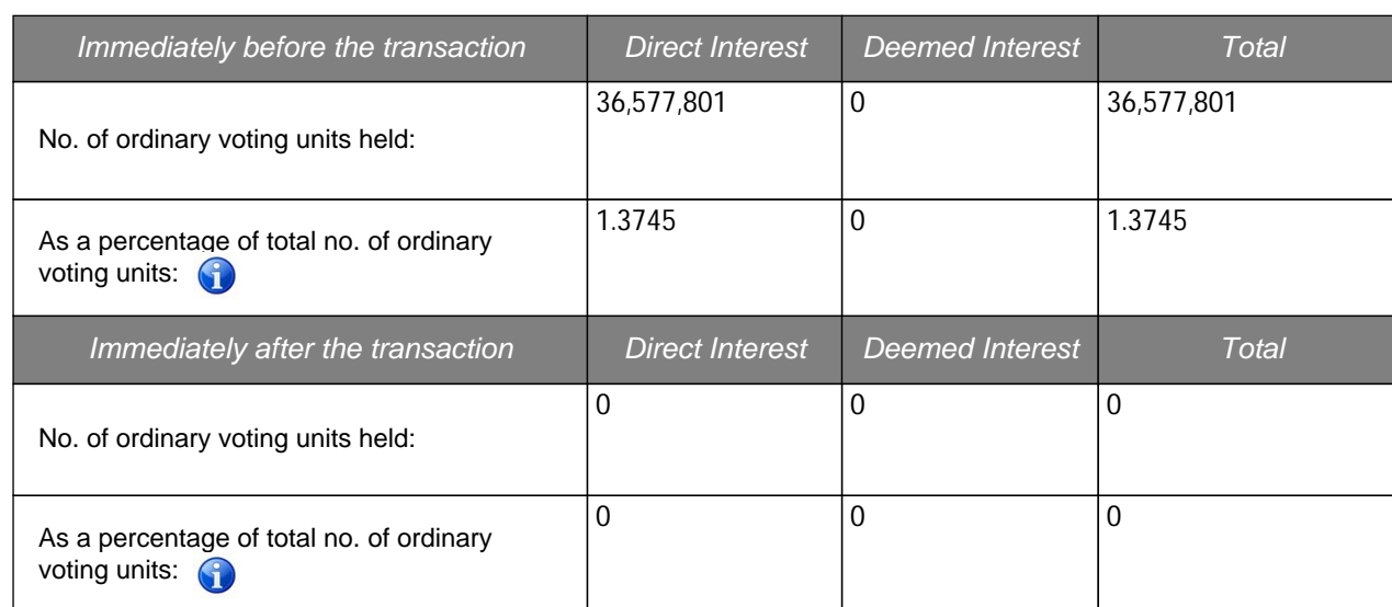
Table 1. Change in respect of ordinary voting units of Listed Issuer